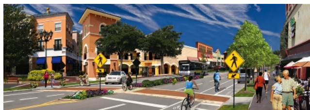
"Complete Streets" concept