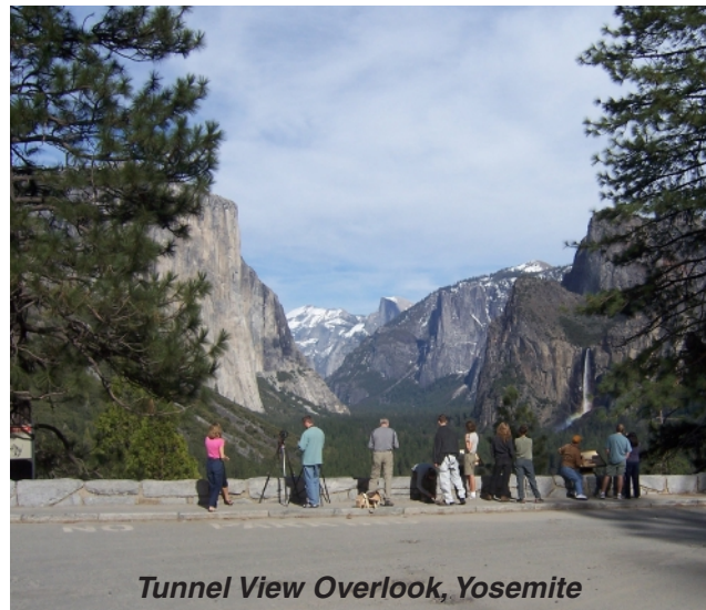
Tunnel View Overlook, Yosemite